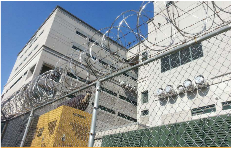
Etowah County Detention Center in Gadsden, Alabama

Representative Robert Aderholt (R-AL) and other members of Congress from Alabama immediately acted to countermand ICE's plan to close the facility because of the potential loss of jobs in the county. Senator Richard Shelby (R-AL), who sits on the DHS Appropriations Committee, threatened ICE's funding if it moved forward with terminating Etowah's contract, after which ICE rescinded its decision and cancelled plans to close the facility. 65 Despite ICE's efforts to end the contract due to the facility's remote location and lack of immigrants' access to counsel, Etowah continues to detain immigrants today.