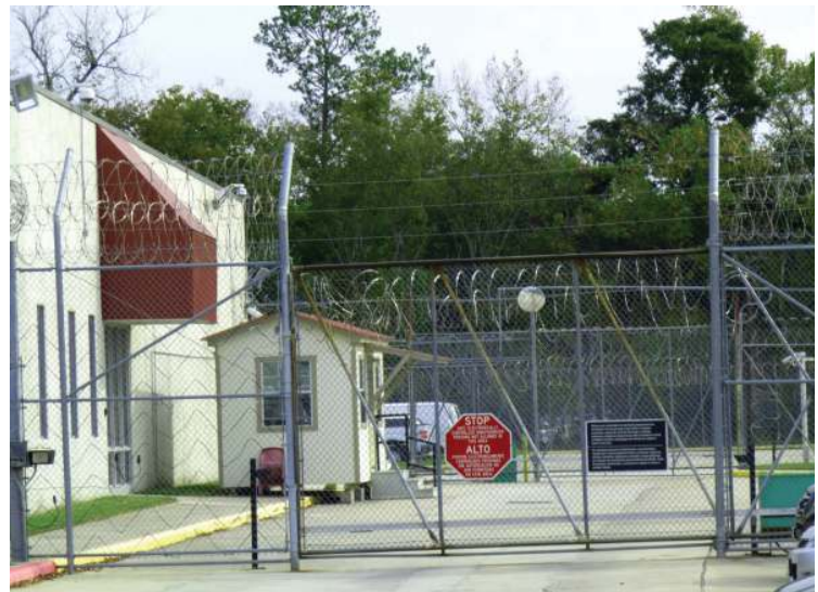
Houston Processing Center

In 1984, CCA built the first private prison in the U.S., the Houston Processing Center, an immigration detention center in Houston, TX. Although the private prison system has grown considerably since then, in the late 1990s, the industry lost steam as CCA almost went bankrupt and the stock of Wackenhut Corrections Corporation (now GEO) fell significantly. 17 After being bailed out by the now-defunct hedge fund Lehman Brothers, the private prison industry saw the government’s post-9/11 interest in expanding immigration detention as a potential cash cow and began vying for more federal contracts to incarcerate immigrants. 18